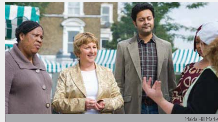
Maida Hill Market

Crime and anti-social behaviour top many people's list of concerns and so continue to be a priority for me.