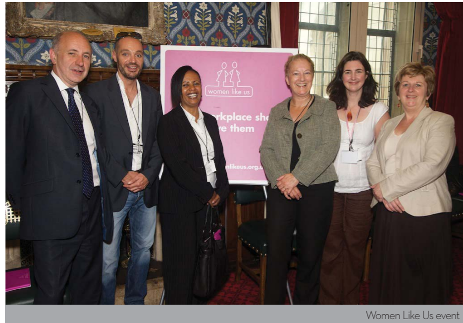
Women Like Us event

Not only is unemployment devastating for the individuals it affects, it also damages the wider economy. We must do everything we can to reduce its impact. I have been doing a number of things locally to help make this happen.